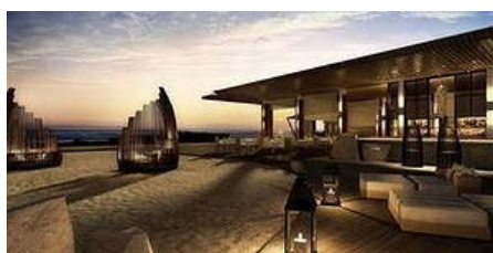
The Bali concept for PaperPlanes.